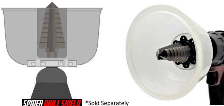
SPIDER DRILL SHIELD *Sold Separately

Use with our Spider Drill Shield for the ULTIMATE PAIRING!